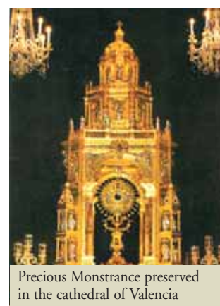
Precious Monstrance preserved in the cathedral of Valencia