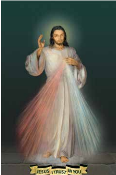
Chaplet of Divine Mercy Said on Rosary Beads

The Blessed Image of Jesus the Divine Mercy is distributed to anyone of goodwill who will accept and display it in their home as a means to receive special graces for strengthening, healing and/or restoring marriages and families.