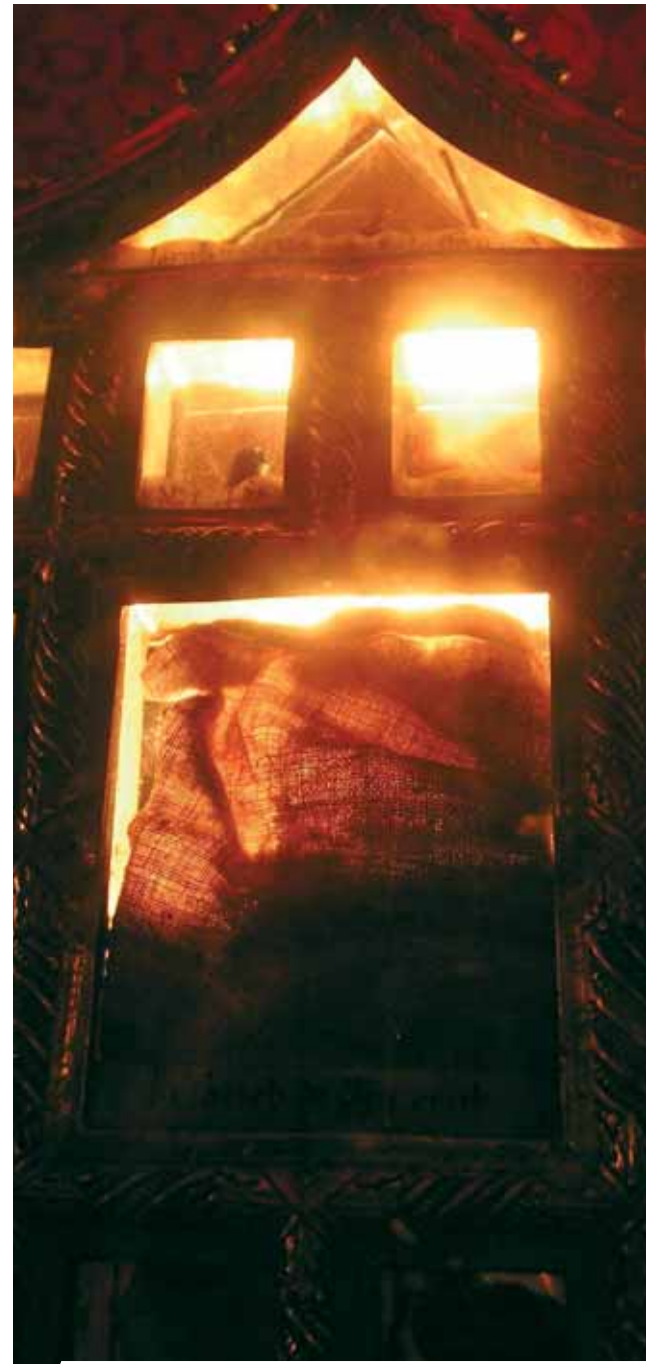
Detail of the monstrance containing the holy relics