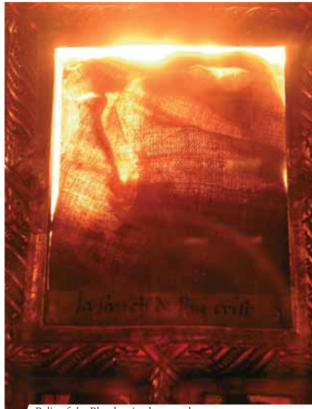
Relic of the Blood-stained corporal

The wine in the chalice was converted into Blood and it was poured on the altar cloth flowing until it hit the ground.