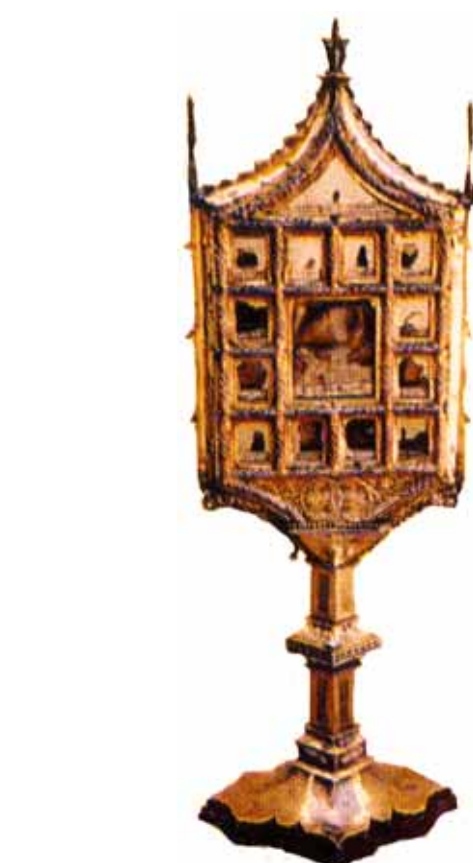
Monstrance containing the relics of the miracle