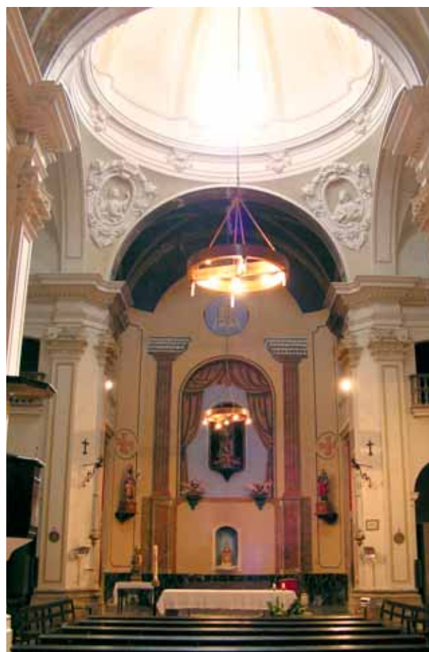
Inside the Church of San Cugat