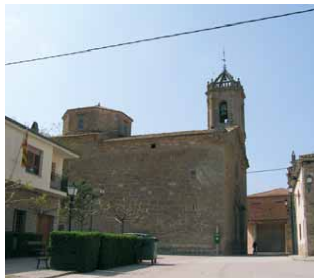
Church of San Cugat, where the relics of the miracle are kept