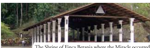
The Shrine of Finca Betania where the Miracle occurred