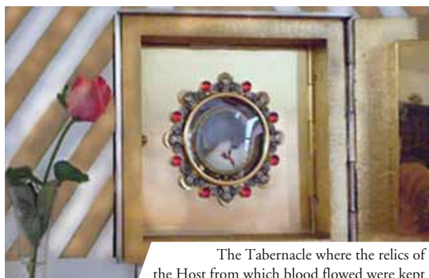
The Tabernacle where the relics of the Host from which blood flowed were kept